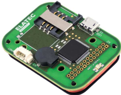
TWN4 MultiTech 3 BLE PCB top view