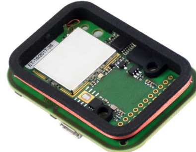
TWN4 MultiTech 3 BLE PCB bottom view

The TWN4 MultiTech 3 BLE integrates RFID (125 kHz and 13.56 MHz), NFC and Bluetooth Low Energy capabilities into a compact but powerful reader. Its reduced size combined with optimized read/write performance makes it the perfect reader for all applications where small size and full performance matters, e.g. print solutions, driver identification, POS integration and many more. Furthermore, the TWN4 MultiTech 3 BLE provides access to most common host interfaces such as USB, serial (TTL) or I 2 C which are readily accessible through an on-board connector.