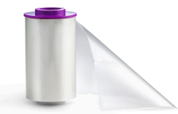
A wasteless lamination roll wherein no carrier film and subsequent take-up core is required.

In contrast, wasteless lamination technology aims to reduce this level of needless waste by eliminating the need for carrier film and thus, a subsequent take-up core. With wasteless lamination, overlamine patches are attached to one another in a continuous stream of material, on a single roll and without an underlying carrier. As each patch is detached from its supply roll and adhered to a card, the lamination cycle is completed.