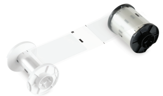
A traditional overlamine roll with lamination patches, carrier film and take-up core.

The first "supply" roll consists of new laminate patches adhered to carrier film that is wrapped around a supply core. The second roll consists only of an empty "take-up" core. When the laminate from the first roll has been adhered to the card, the take-up core then "takes up" the left over carrier film. After the supply roll has been depleted of laminate patches and the take-up core has been filled of subsequent leftover carrier film, the operator then removes both cores along with the used carrier film. Ultimately, this traditional lamination process produces the following waste byproducts: two cores and a full roll of used carrier film - none of which are easily recycled.